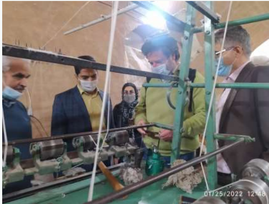
Zilu of Meybod, Iran